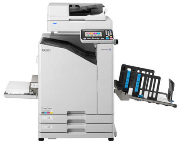
Wide stacking tray