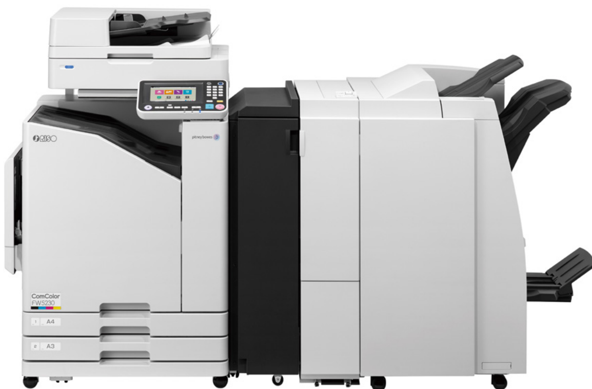
Staple and hole punch