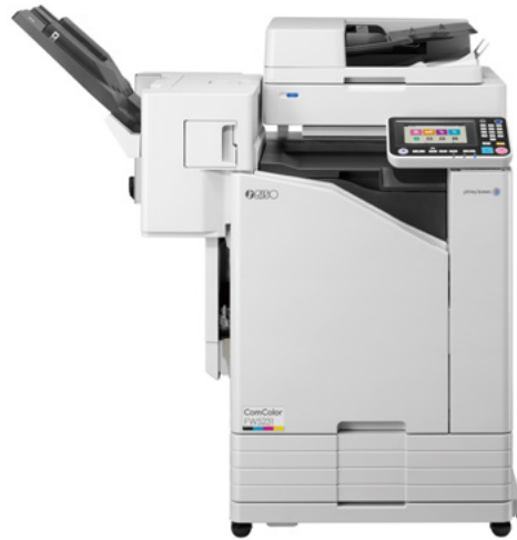
Staple and offset stacking

The optional IC Card Authentication Kit enables user management using an IC card.